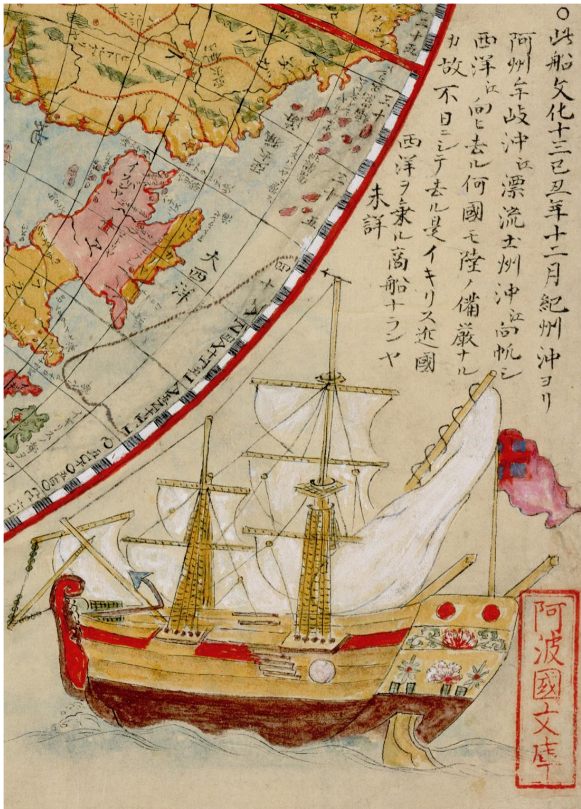
The British merchant vessel that appeared off Mugi in the 12 th month of the 13 th year of Bunka [sic].