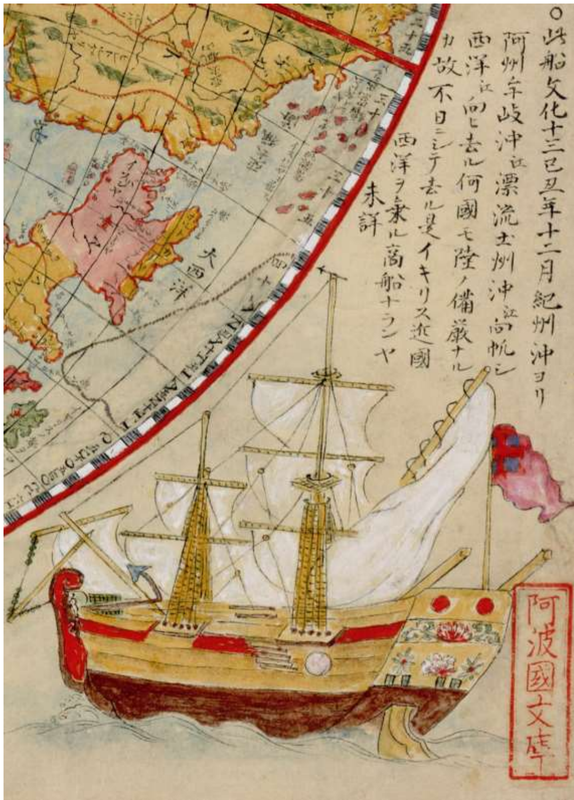
The British merchant vessel that appeared off Mugi in the 12 th month of the 13 th year of Bunka [sic].